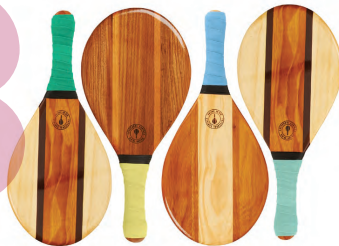
Ping pong is the perfect sport to play indoors or outdoors, and with these pastel dipped handcrafted paddles, beer pong players need not apply!