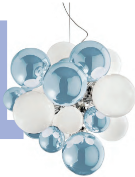
It's a celebration all the time in any dining room featuring this Murano hand-blown glass chandelier fashioned like designer balloons.