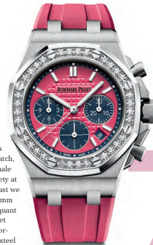
The ultimate men's accessory is the watch, and the ultimate male should have a variety at his disposal... at least we think so! These 37mm watches offer a piquant mix of diamonds set bezel with ready-for anything stainless steel case, and rubber strap. After all, nothing says casual glam like rubber and diamonds!