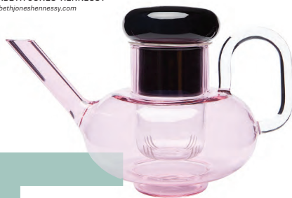
There is nothing like serving tea that's pretty in pink. Inspired by laboratory apparatus, these handmade tea pots are both soothing and satisfying.