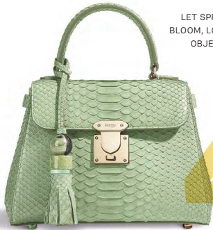
Luxury comes in mint green in Asprey's python and patent oyster crocodile mini bag. The crocodile tassel and palladium finished features allow this number to be the star of any wardrobe both day and night!

Curated by ELISABETH JONES-HENNESSY www.elisabethjoneshennessy.com