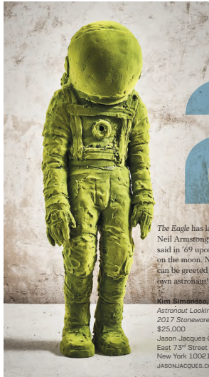
The Eagle has landed. Neil Armstrong famously said in '69 upon landing on the moon. Now you can be greeted by your own astronaut!