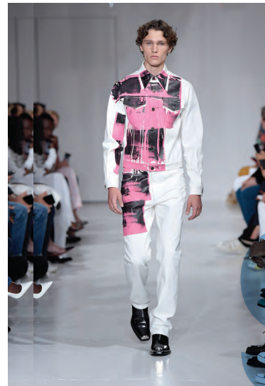
Calvin Klein 205W39NYC , printed white denim jacket (Printed artwork: Andy Warhol, Little Electric Chair, 1964-65 © The Andy Warhol Foundation) $850 Printed white straight-leg denim pant (Printed artwork: Andy Warhol, Little Electric Chair, 1964-65 © The Andy Warhol Foundation) $595 Western ankle boot. $1295 CALVINKLEIN.COM