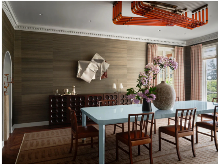
The slick, robin's egg blue lacquered dining table makes a serious statement in a historical Seattle estate designed by Clive Lonstein. Douglas Friedman