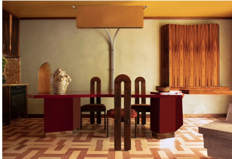
A lacquered ceiling, dining table, and console in Hugo Toro’s Paris apartment Matthieu Salvaing

More practically, though, that shine can work wonders to enlarge a space, adding more depth to otherwise petite rooms. Mexican French designer Hugo Toro’s own, rather compact Paris apartment is an enviable example. “I used lacquer in a yellow shade to visually enlarge the space by emphasizing the vertical lines,” he explains of the flat, where the dining table, console, and more are also slicked in shine. In Toro’s buzzy redo of Villa Albertine in New York, he used decorative wall panels made with crackled lacquer. “It captures light and creates variations throughout the day, bringing a mysterious or boudoir atmosphere,” he explains.