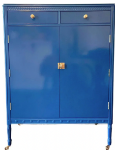
Modern Gloss Lacquer Bar Cabinet