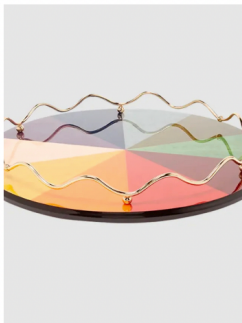
Rainbow Lacquer Large Tray