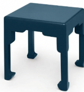
Small Gazebo Side Table by Veere Grenney