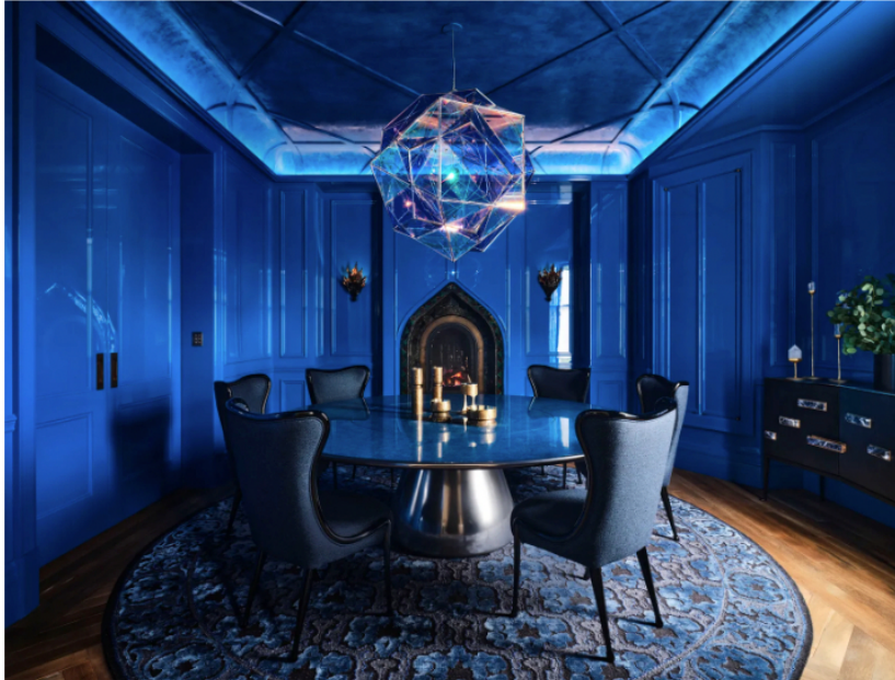
A blue lacquer dining room is the star of this San Francisco manse by Nicole Hollis. The custom dining table also features a blue urushi lacquer top. Douglas Friedman

When we talk about lacquer today, we're often referring to a surface that is slick, shiny, and catches the light. There are a range of products on the market that give off that signature sheen. But the real deal—or "true lacquer," as it is sometimes called—originated in Asia, with some of the earliest examples found in Japan, circa 7,000 BC. Using this technique, objects were coated with several layers of processed tree sap which, after drying, creates a hard, smooth—and also more durable—finish. Red and black pigments were then created by adding iron oxides to the raw lacquer.