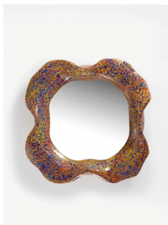
Orchidée Mirror by Roland Mellan