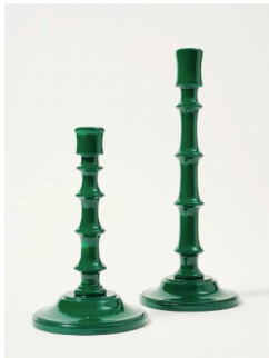
Cinzia Lacquered Green Candle Holders