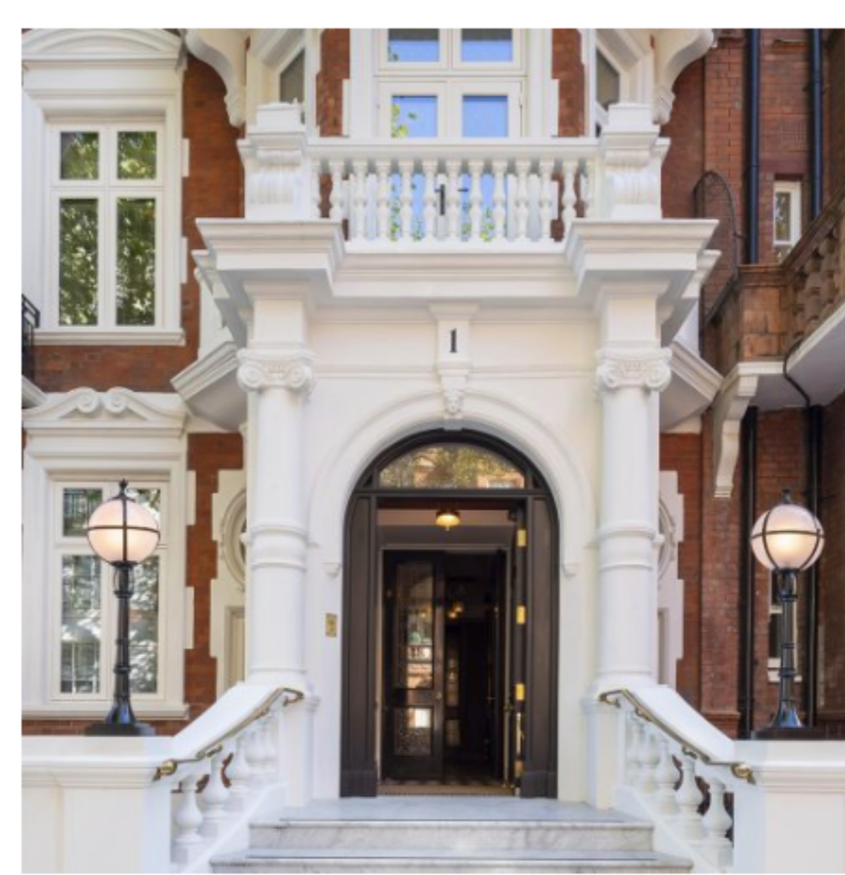
STYLE + DESIGN Hotel of the Week: Swanky London Retreat Blends British Charm and French Flair

Live artfully with curated stories straight to your inbox