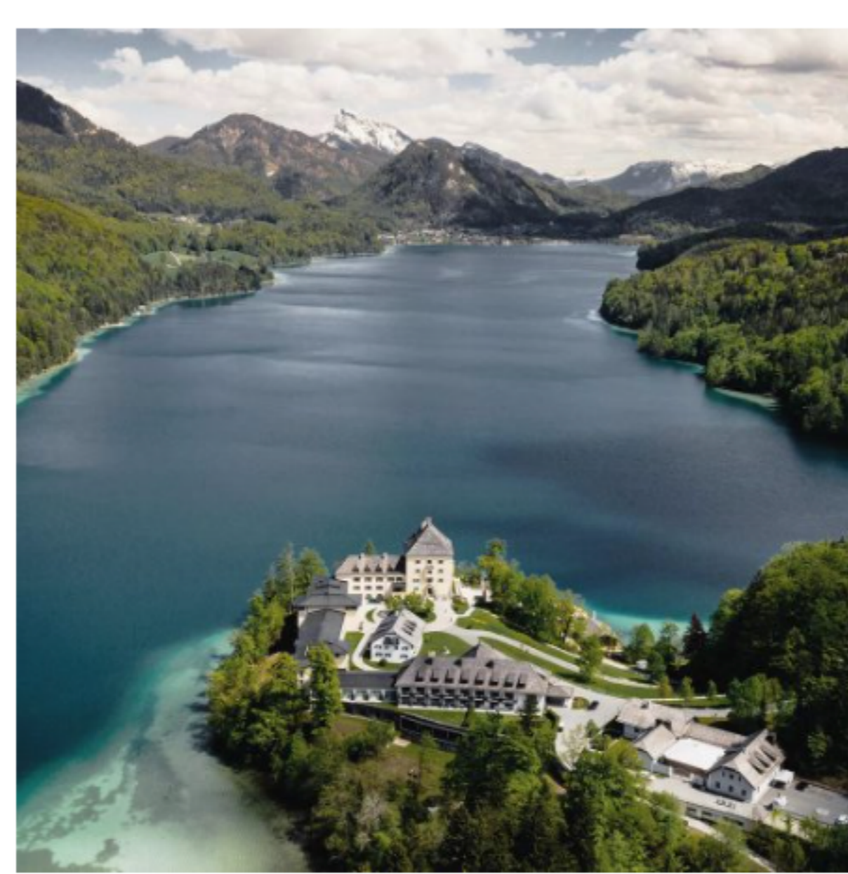
STYLE + DESIGN 11 of the Most Anticipated Hotels Opening in 2024