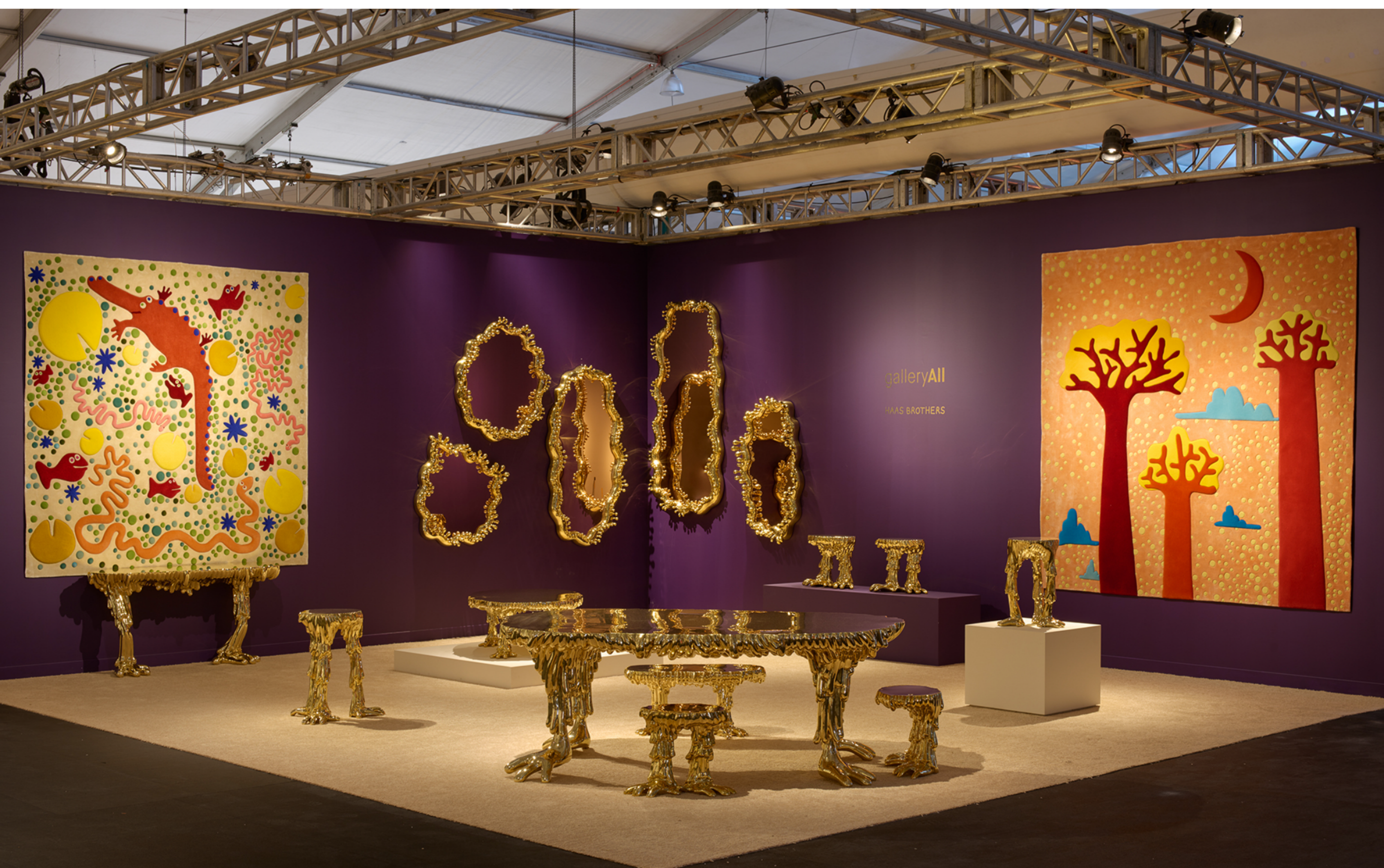
Gallery All's booth at Design Miami/ PHOTO: JAMES HARRIS

ON VIEW / NEW YORK TADASHI ASOMA FINDLAY GALLERIES