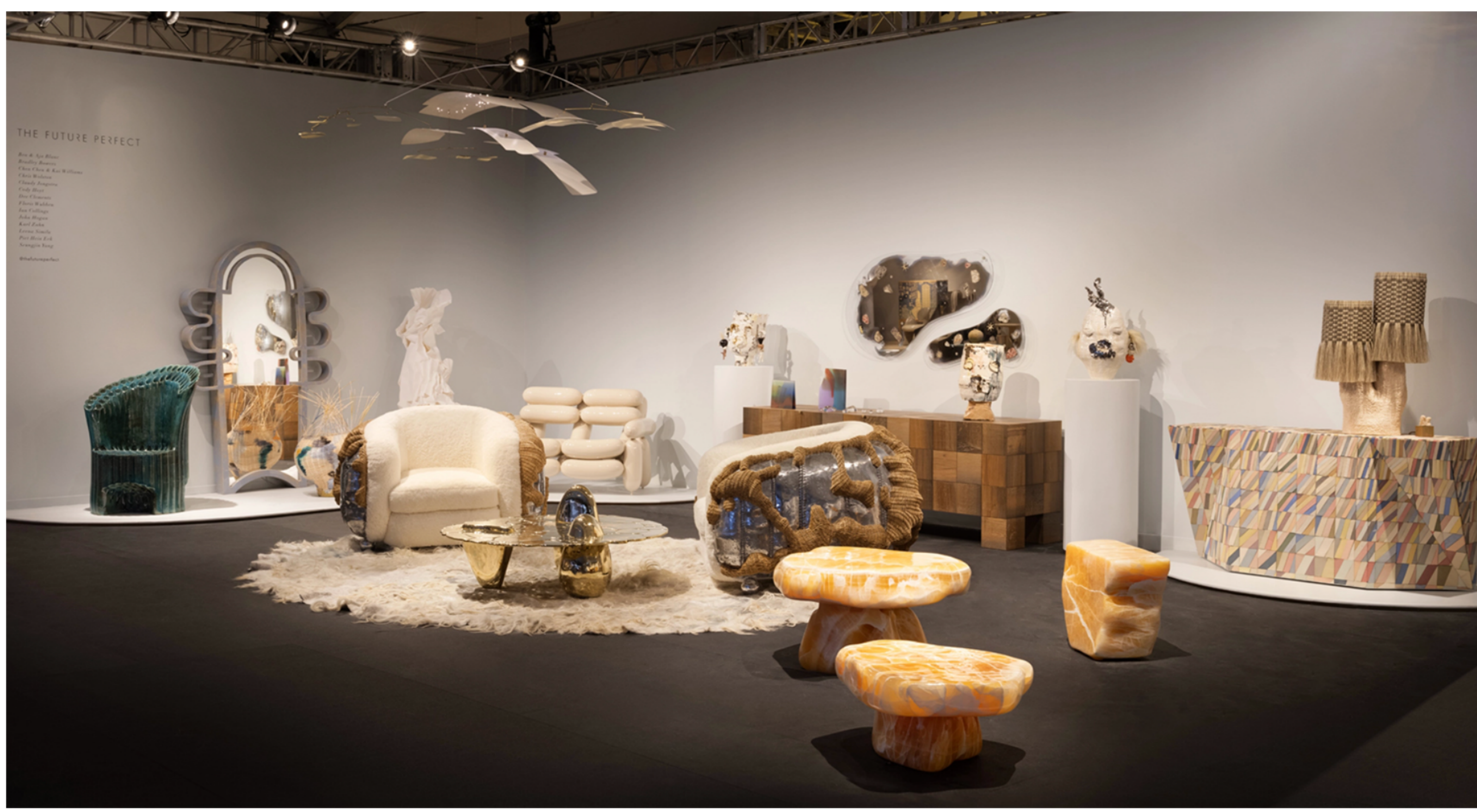
The Future Perfect's booth at Design Miami/ PHOTO: COURTESY OF THE ARTISTS AND THE FUTURE PERFECT

"I selected the theme 'the Golden Age' with the ambition of exploring how it might be applied across great stretches of human existence, from the distant past to our collective future," explained Didero. "Design Miami's flagship fair in Miami Beach is always full of energy and optimism for the future. At a time when human beings are challenged in unprecedented ways, I hope that the theme will offer a source of inspiration to imagine and shape a brighter future for our planet and all its inhabitants."