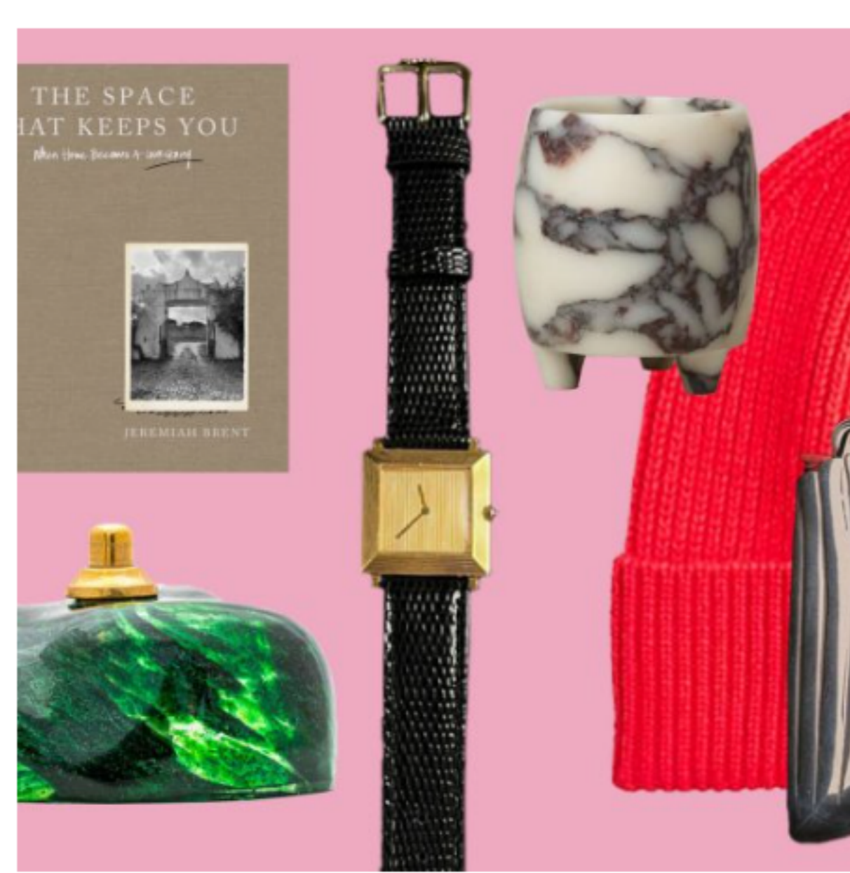
STYLE + DESIGN Jeremiah Brent Reveals His Valentine's Day Wish List