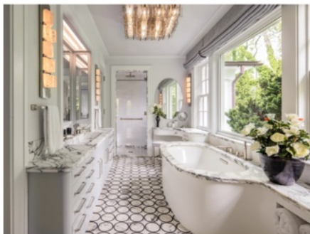
In the primary bathroom, a flush-mount light by John Salibello is paired with wallcovering by Wolf-Gordon, window treatments in de Le Cuona fabrics and plumbing fixtures by Kallista.

Contrast is the quiet hero. White lacquer cabinetry and stainless steel surfaces meet dramatic Panda marble, proof that a restrained palette doesn't have to feel flat. Above all, the home is designed for living. "We wanted the home to feel as durable as it is beautiful," Zerbini says.