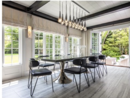
In the dining room, a chandelier by Jonathan Browning establishes a focal point, complemented by dining chairs by Duijst, sconces by Kalin Asenov, window treatments in Zimmer + Rohde fabrics and glass sculptures by Simone Crestani.

Texture and detail deepen the story. Pale gray Veneziano plaster walls shift subtly with the light, creating what Zerbins calls "a quiet depth." Handwoven leather tiles frame the passage to the primary suite, setting the stage for a Mattia Bonetti sculpture in a small but deliberate moment of drama.