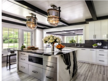
The kitchen features pendants by The Urban Electric Co. above an island with a BAS Stone countertop, complemented by cabinet hardware from Holland & Sherry, counter stools by Powell & Bonnell, floors by Stone Source and a Holly Hunt bench upholstered in leather by Moore & Giles.