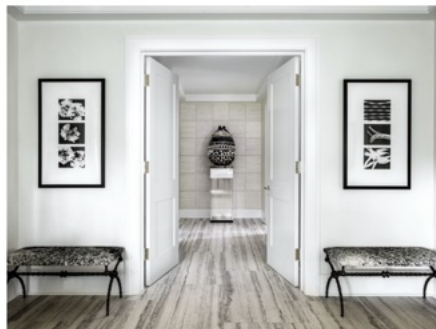
White woven Core Pezara leather wall tiles by Studioart provide a textured backdrop for a Mattia Bonetti sculpture on a custom acrylic pedestal, accompanied by the client's existing photogram studies.

While the home began as a Victorian farmhouse with a series of smaller rooms, the floor plan leans into an expansive mode of Hamptons living. A reconfigured kitchen sits at the home's heart, flowing into living and dining spaces and spilling seamlessly onto an outdoor patio. "This creates a natural indoor-outdoor flow... and allows gatherings to feel cohesive rather than fragmented," Zerbins says.