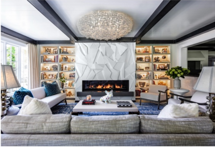
The living room is defined by a chandelier by Ironies and a fireplace by Malcolm Hill. A Stark carpet grounds seating by Kimberly Denman, alongside a John Dickinson side table and a Holly Hunt coffee table. Finishing touches include table lamps from Bernd Goeckler Antiques, Blanche Field lampshades, Rosemary Holgarten pillows and Zimmer + Rohde window treatments.