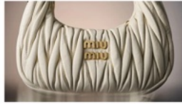
Miu Miu's quilted 'Wander' is a contemporary it-bag