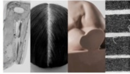
Step into the contemporary puzzle of Martin Margiela's first large-scale exhibition in Japan