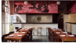
Faye Toogood brings a surrealist edge to this new London restaurant