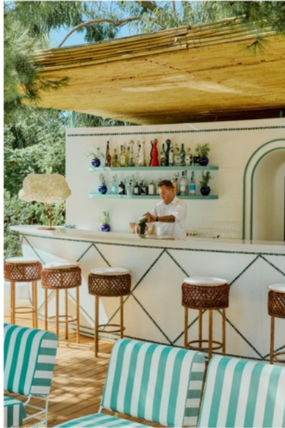
Custom bar lamps by Orsina Sforza

There's plenty of room to sunbathe at Le Sirenuse Mare, which sports 36 sunbed pairs shaded by 18 beach umbrellas on its lower level. By the midterrace, guests will find five cabanas made of varnished steel and covered with weatherproof linen fabrics by Emporio Sirenuse, hand-embroidered in India. Meanwhile, on the upper terrace of the seafront area is an al fresco lounge and a kiosk named Rose's Bar in honour of British artist Rose Wylie , whose monumental painted bronze sculpture Pineapple stands nearby.