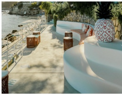
Rose Wylie, Pineapple , 2020, painted bronze

There's plenty of room to sunbathe at Le Sirenuse Mare, which sports 36 sunbed pairs shaded by 18 beach umbrellas on its lower level. By the midterrace, guests will find five cabanas made of varnished steel and covered with weatherproof linen fabrics by Emporio Sirenuse, hand-embroidered in India. Meanwhile, on the upper terrace of the seafront area is an al fresco lounge and a kiosk named Rose's Bar in honour of British artist Rose Wylie , whose monumental painted bronze sculpture Pineapple stands nearby.