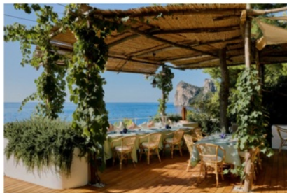
Le Sirenuse Mare Restaurant