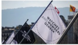
The countdown is on for Watches & Wonders 2026