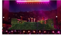
From Sabrinawood to Bieber's minimalism: Coachella 2026's best stage designs