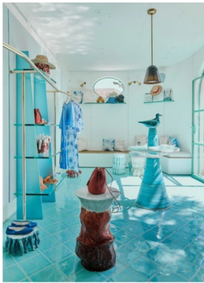
Emporio Sirenuse store