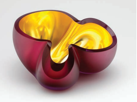
Artist Barbara Nanning's extraordinarily labor-intensive pieces involve caning, glass blowing, hand forming, and sometimes sandblasting exteriors of pieces while polishing their edges, and attaching metal leafing. Represented by J. Lohmann Gallery . From $8,000; jlohmanngallery.com

Two great talents—metal artist Vikram Goyal and hand-painted wallpaper firm de Gournay —partnered on three sumptuous bas-relief designs on gilded paper evoking Goyal's masterful brass repoussé. $2,500/panel; degournay.com